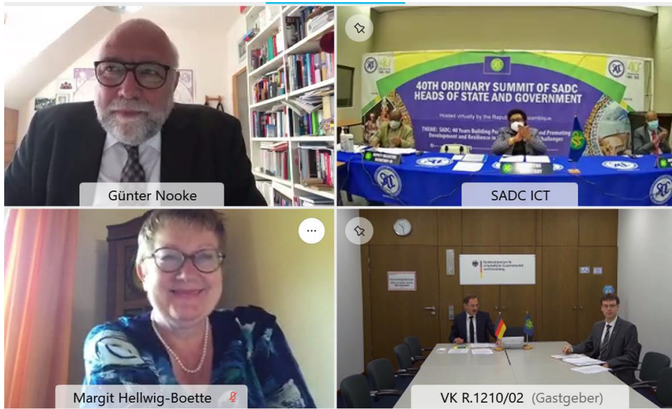
The SADC and German Delegation applaud the successful conclusion of the bilateral negotiations